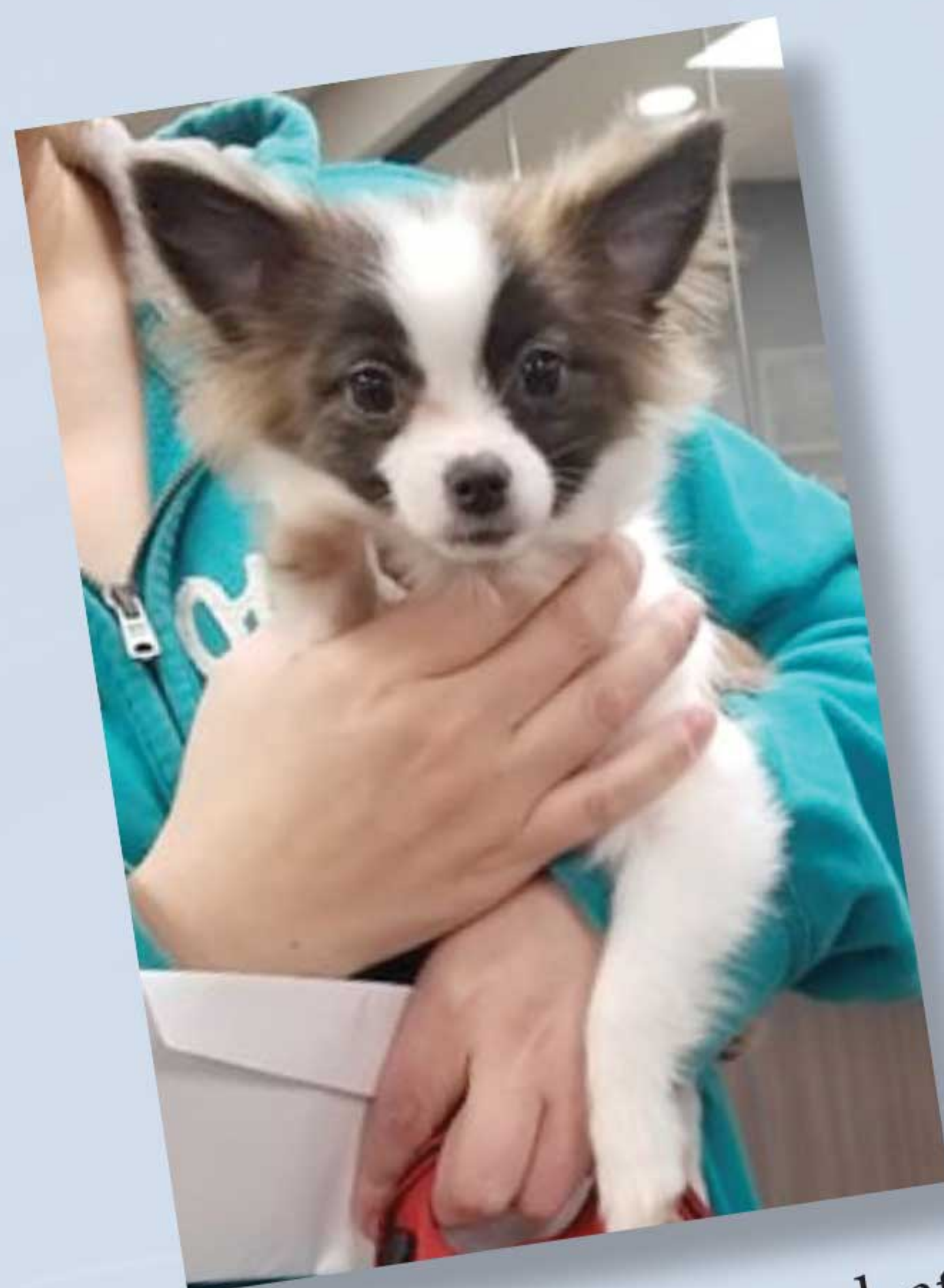
Kimchi is very beloved at the Wauwatosa branch!