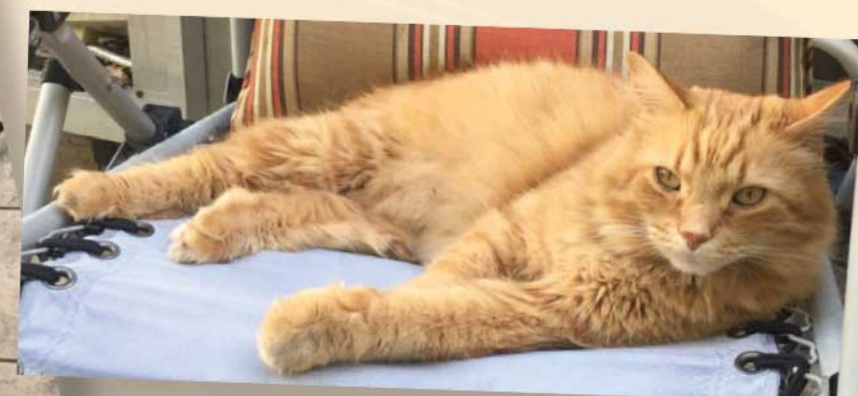
Levi is a rescue from Waukesha Humane Society.