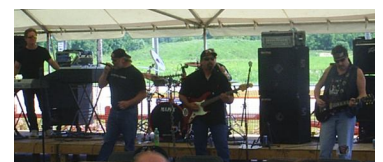
The Sociables rocked the house.