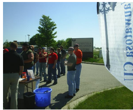
Riders met at the WCU Menomonee Falls branch for registration.

Wauwatosa Credit Union sponsored its 2 nd Annual Poker Run for Children's Miracle Network on Saturday, June 9 th . The motorcycle ride raised $10,332.00 for Children's Miracle Network.